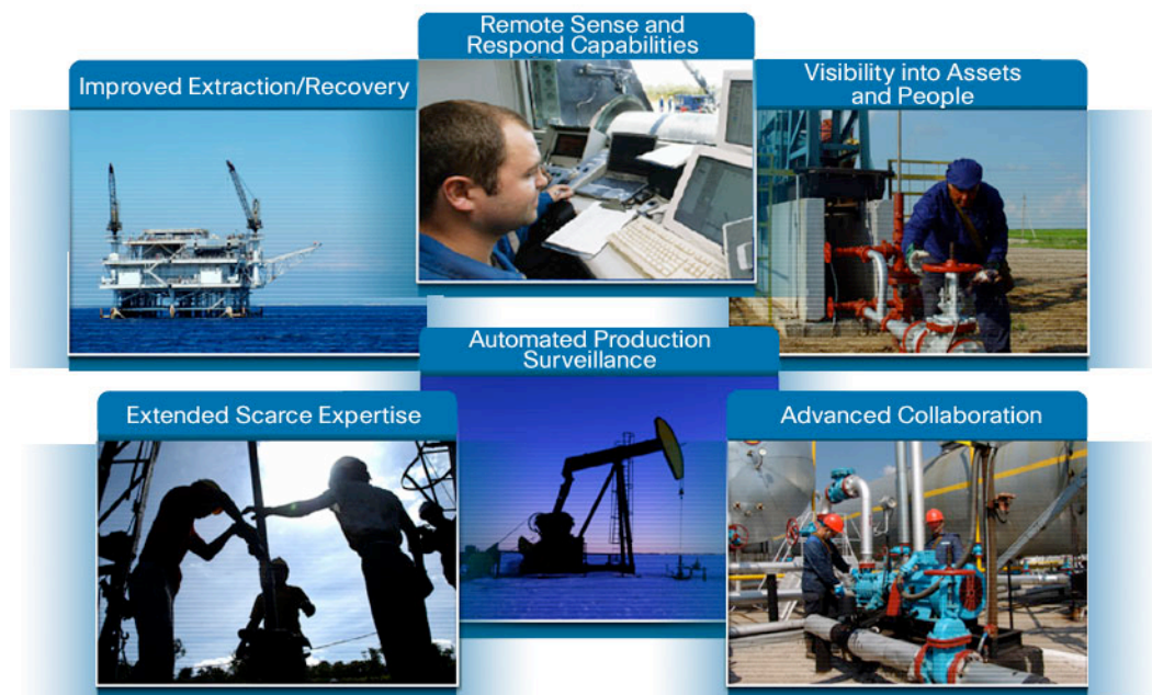
Figure 1. Benefits of First Mile Wireless

The benefits and drivers for the DOFF will be initially realized in the First Mile with networking solutions that can be implemented in this harsh and remote environment. Based on IP standards, these deployments can be easily expanded, enhanced, and upgraded at a later point of time to accomplish the vision of the DOFF while keeping cost of ownership low.